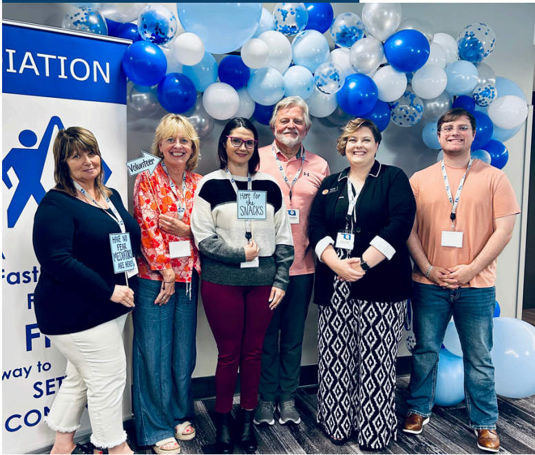
Volunteer Conference 2024