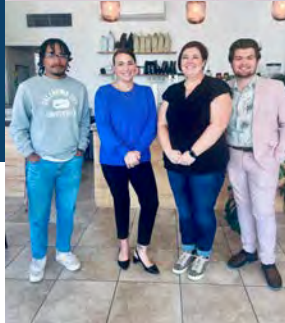
Volunteer Meet-Ups Left- Pontotoc County Right- Garvin County