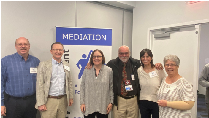
Southeast Volunteer Mediators 2022 Volunteer Conference

CONTACT YOUR LOCAL PROGRAM DIRECTOR TO REGISTER!